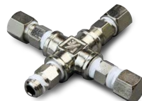
3 WAY OUTLET