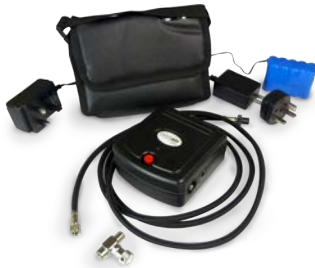
Mistair™ Freedom Full Kit

Compact and lightweight, market leading Mistair compressors put the power and control for optimal Airbrushing into your hands.