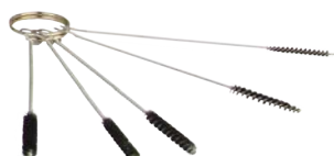
CLEANING BRUSH SET