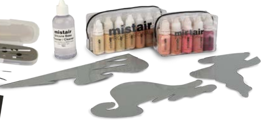
Mistair™ Professional HD Make-up Kit