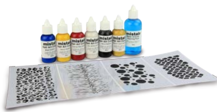
Mistair Airlites™ Hair Art Kit