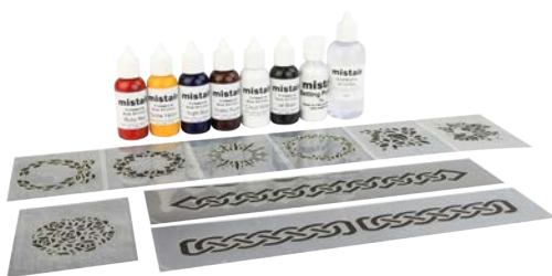
Mistair™ Body Art Kit