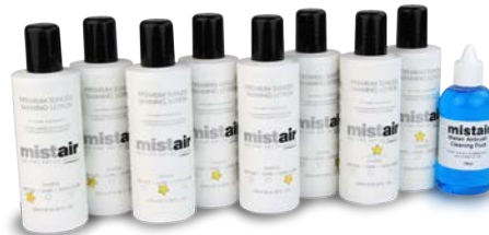
Mistair™ Sunless Tanning Kit