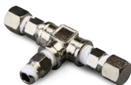
2 WAY OUTLET

Mistair outlets provide a simple & straightforward way to supply two or more airbrushes from one air source, typically being fitted directly to the airbrush compressor outlet. All outlets supplied with blanking caps to enable single use.