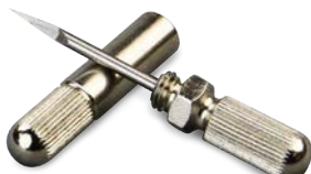
NOZZLE CLEANING NEEDLE