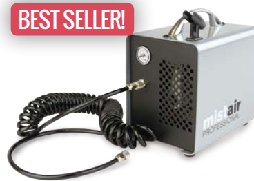
Mistair™ Solo Pro