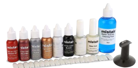
Mistair™ Nail Art Kit