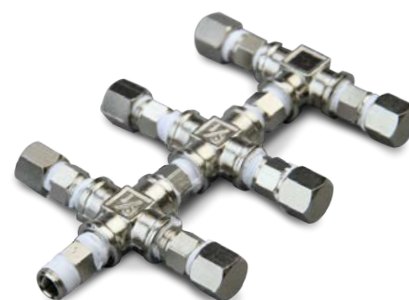
6 WAY OUTLET