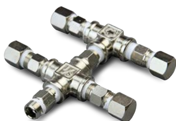
4 WAY OUTLET