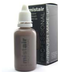
Individual 30ml Adjuster & Corrector Colours

Team with our brow stencils for the ultimate Hi-Definition look. Also double as eyeshadows. See colour chart for individual product codes