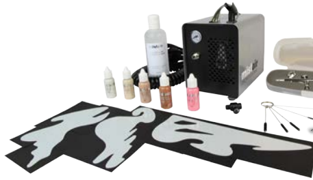
Mistair™ Airbrush Make-up Starter Kit (Solo Pro Upgrade)