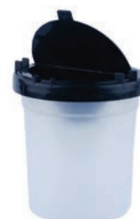
THE AIRBRUSH CLEANING CUP

This Airbrush Nozzle Cleaning set is specifically designed to keep your airbrush nozzles, air caps, product paths and feed pipes in good working condition.