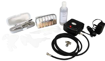
Mistair™ Airbrush Make-up Starter Kit