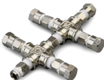
5 WAY OUTLET