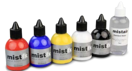
mistFX™ Aqua Body Paints