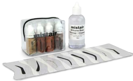
Mistair™ Professional HD Brow Kit